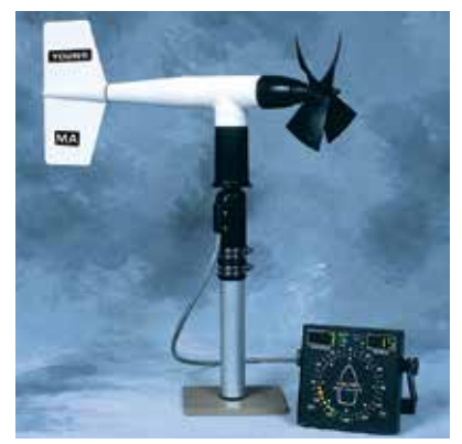
Wind Monitor - MA pictured with Marine Wind Tracker display.

For specific applications, separate signal conditioning devices are available. Model 05603C Wind Sensor Interface offers calibrated 0-5VDC outputs for wind speed and wind direction. Model 05631C Wind Line Driver provides calibrated 4-20 mA current signals for each channel, useful in high noise areas or for long cables of up to several kilometers. Each interface circuit is supplied in a weatherproof junction box with mounting hardware for installation near the sensor.