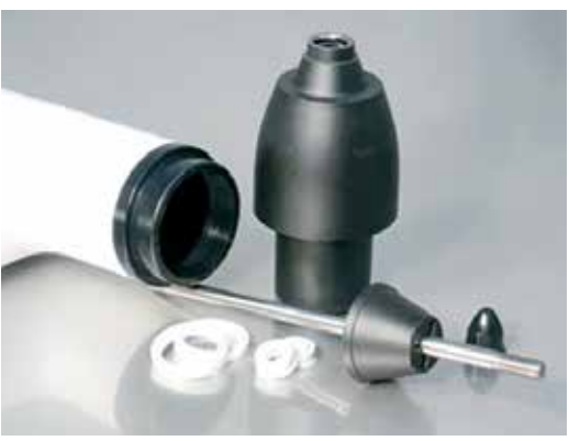
Ceramic bearings are long lasting and corrosion resistant.